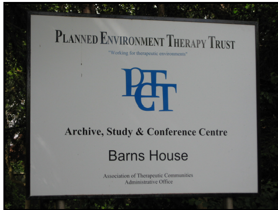
Therapeutic Community Archive Facility