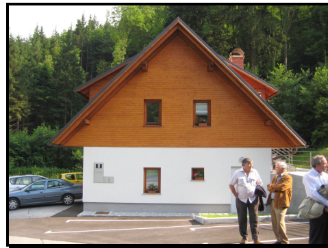
The newly completed accommodation for final stage residents.