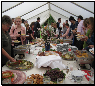
A sumptuous feast prepared by the residents, their families and people from the local village.

We were welcomed by the Mayor of Skofia Loka and the Manager, staff and residents who had prepared a musical greeting for us. The TC is set in a valley surrounded by pine covered mountains.